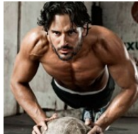
The Only 5 Exercises You'll Ever Need