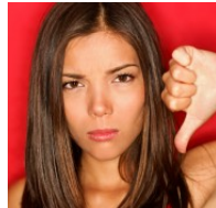
10 Biggest Turn-Offs for Women