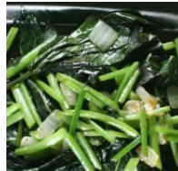
The Ridiculously Healthy Greens You've Never Heard Of